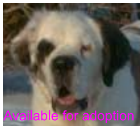
Trinity of Hope's I'sa Southern Belle (ZaZa)