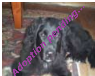
Trinity of Hope's Dark Lady (Kira)